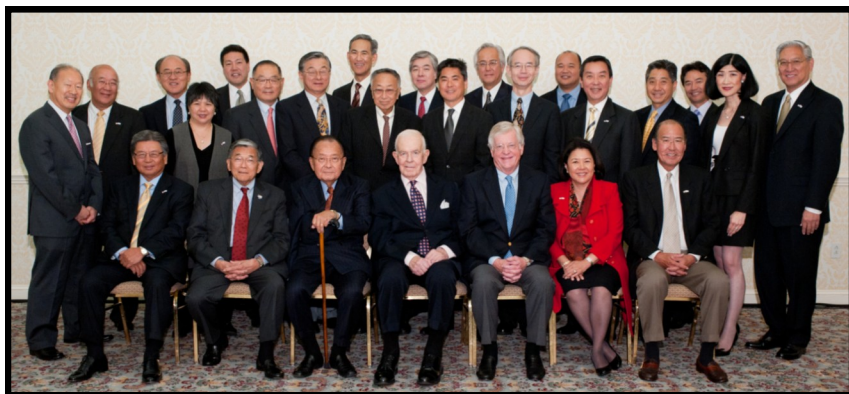
U.S.-Japan Council Board of Directors and Board of Councilors at the 2010 U.S.-Japan Council Inaugural Annual Conference